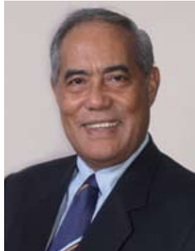
YBhg. Tan Sri Dato' Seri Megat Najmuddin Megat Khas President