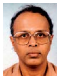
Dr S Radhakrishnan