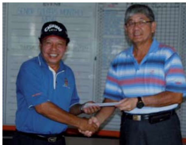
A Medal winner.