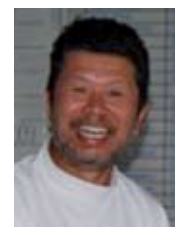
B Medal runner-up.