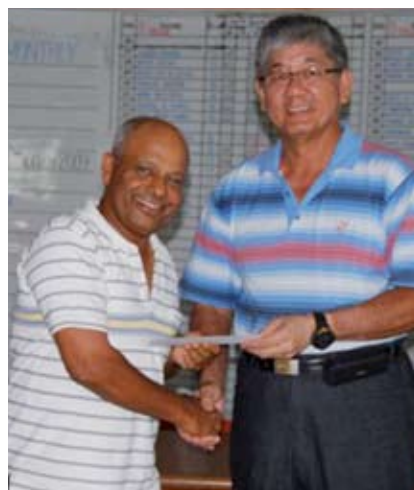
B Medal winner.