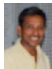
C Medal winner.